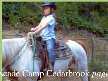
Cascade Camp Cedarbrook page 4