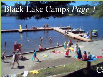
Black Lake Camps Page 4