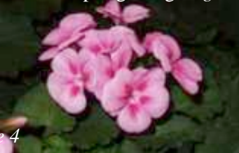
Senior Spring Fling Page 2